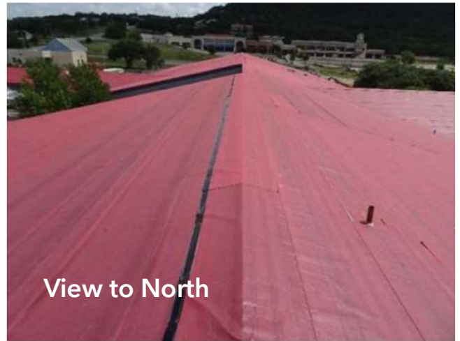
View to North