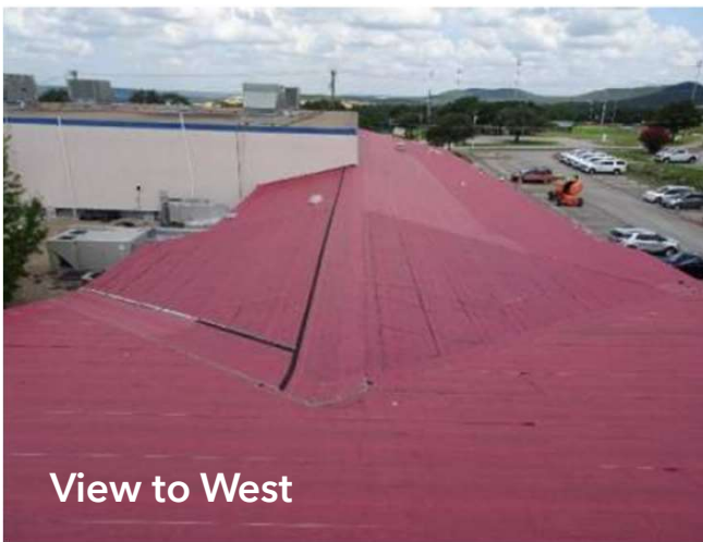
View to West